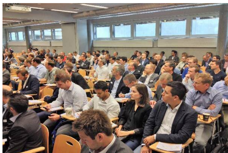
Second lecture hall providing a stage for the key-note speech and the following industry talks

“This talk is about introducing the different modeling approaches which involve machine learning methods.”