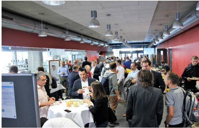
The conference in between talks.

The number of participants exceeded our initial estimates. Overall, we had more than 190 registrations. Regionally, we covered all of Switzerland, with the focus on the larger Zurich area.