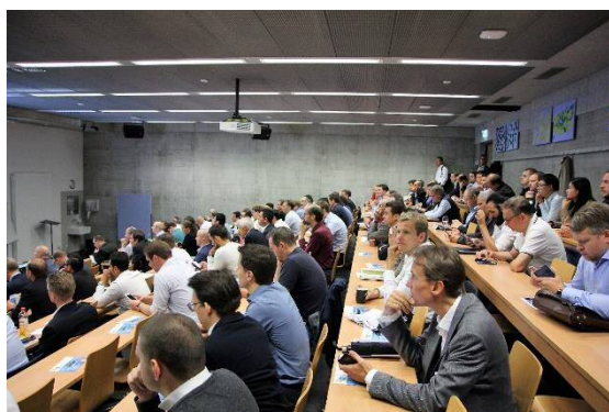
The lecture hall during one of the various finance talks.

"We discuss the types of unusual datasets which are available for trading purposes. We define the difference between unstructured and structured datasets. We also give a case study of using Big Data, creating macro-economic sentiment indices from RavenPack news data, showing how they can be used to trade bonds and FX."